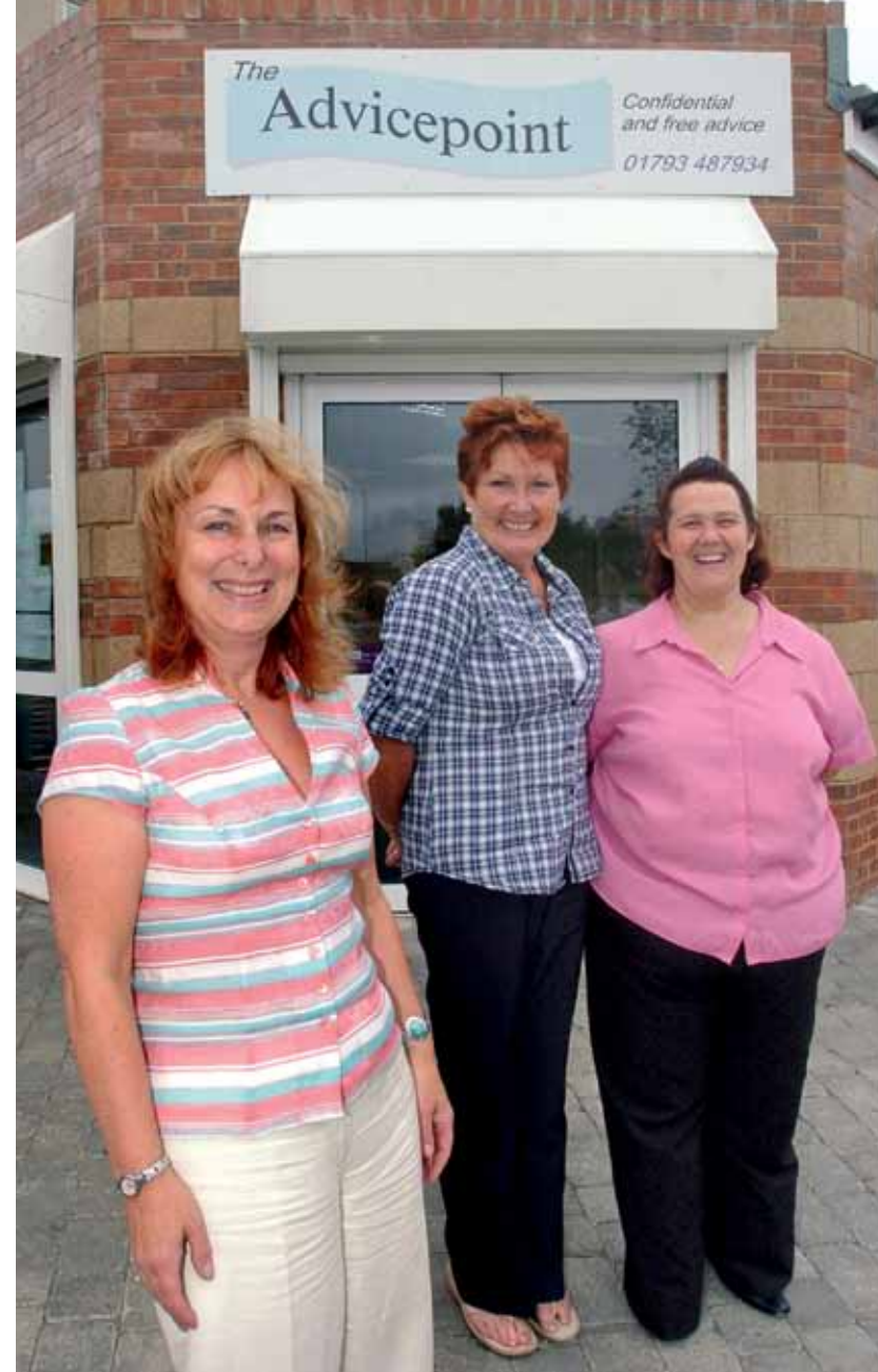
PHOTO ABOVE: PARKS ADVICEPOINT – ONE OF THE GROUPS SUPPORTED THROUGH THE TARGETED SUPPORT FUND