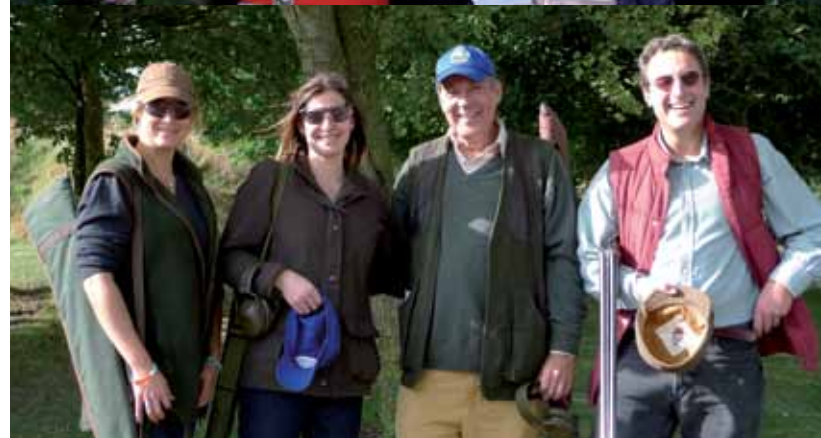
TOP PHOTO: TULIPS AND TEA