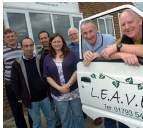
Our grant of £4,259 is supporting a part-time support and recovery worker offering help and support to beneficiaries in building personal confidence, resilience and independence to cope with employment and any external issues.

It was initiated in 2002 as a workers' co-operative to act as a stepping stone from therapeutic activity towards employment. Their initial activity of gardening for the elderly and disabled has expanded to include recycling collection services, woodland management and conservation, community and commercial gardening and the bagging and distribution of recycled materials such as compost.