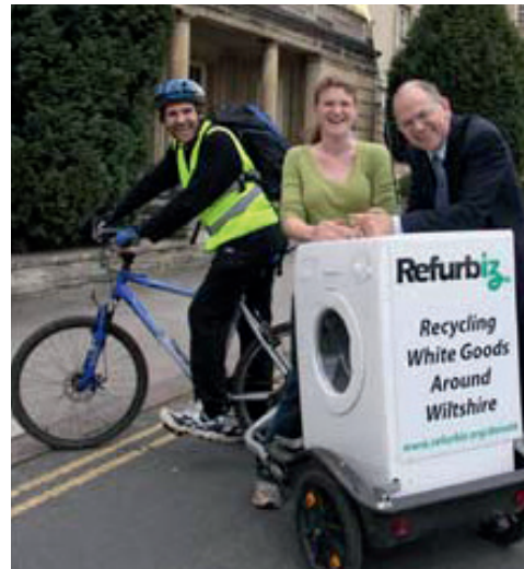
Our grant of £3,394 is supporting the rental costs of the building from where this valuable service is carried out.

For more information visit www.refurbiz.org